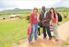
Some of the team at Kasanje Airstrip departing to Beni, DRC from Entebbe, Uganda, June 29, 2009.