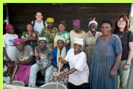
Widows in Goma working to produce flour from maize and wheat and become self-sufficient. A project of HEAL Africa.