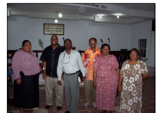
Pastor and some of the congregation from Flowers Bay Church of God Universal.